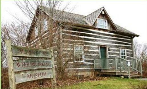
Image of the front of the MacLachlan Woodworking Museum circa 2010

The house was of average size, but “a very nice one,” said a neighbour. Instead of a fireplace, there was a wood-stove for heating and cooking. Modern for the time, a wood stove was considered more efficient than an open fireplace. Additionally, it was the only house in the area to have two full floors.